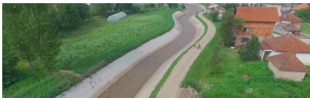
Rehabilitated channel in Krizevica in Republika Srpska