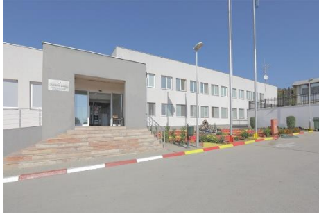
Kumanovo Prison Exterior