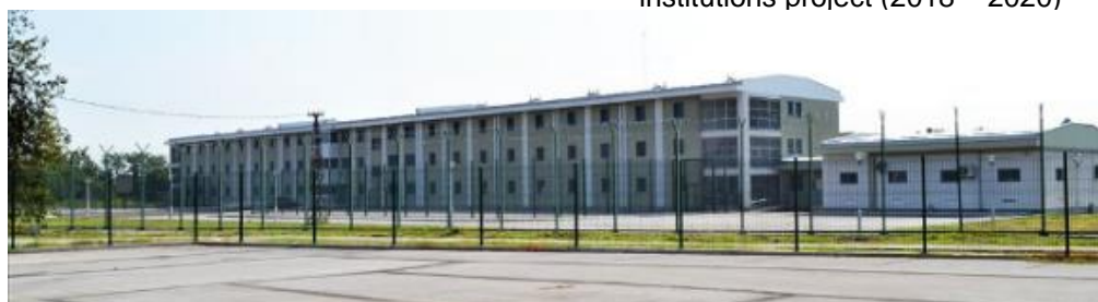
Idrizovo PCF – Semi-Open Section Exterior