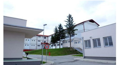
Kumanovo Prison Exterior