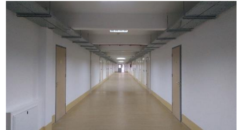
Idrizovo PCF – Semi-Open Section Interior

The overall social aspect of the project will be the improvement of living conditions and rehabilitation opportunities for about 2,500 sentenced persons, remand prisoners and juveniles (thus also contributing to the reduction of overcrowding in the other facilities in the country) and working conditions for around 900 penitentiary staff.