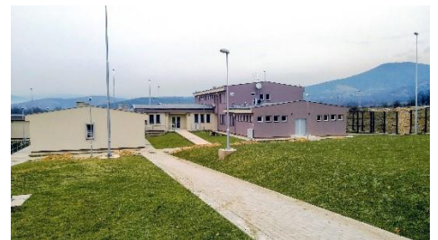
Tetovo JECF – Exterior