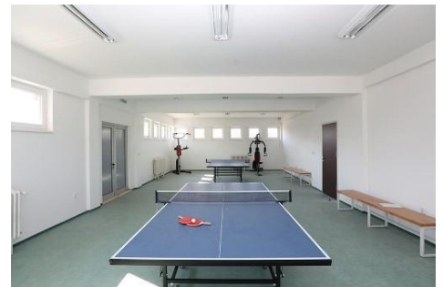
Tetovo JECF – Gvm