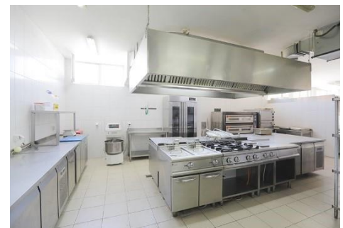
Kumanovo Prison Kitchen