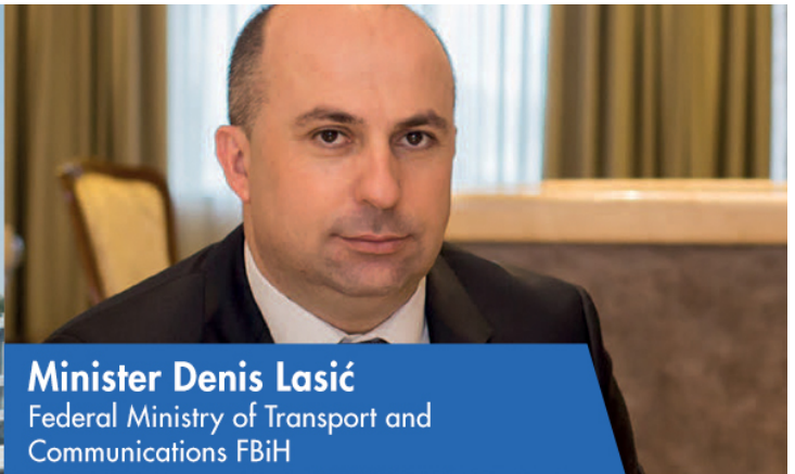
Minister Denis Lasić

'Although most of the activities in BiH have stopped due to the pandemic, we have managed to keep these large infrastructure projects progressing with all the necessary precautionary measures taken.'