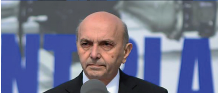
Isa Mustafa, former Prime Minister of Kosovo

'The next phase will allow Regional Water Company Pristina to secure 24-hour drinking water service not only for the citizens of the municipality of Pristina, but also for around 40% of Kosovo's population.'