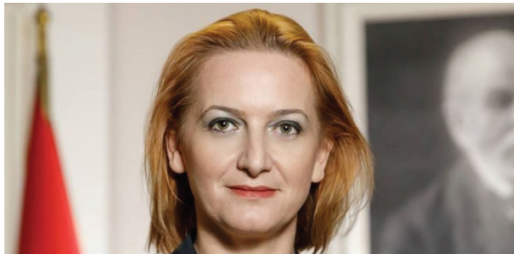
Ms Anila Denaj Minister of Finance and Economy of Albania

through the Instrument for Pre-Accession Assistance (IPA) and €100 million in loans from the EBRD and the EIB.